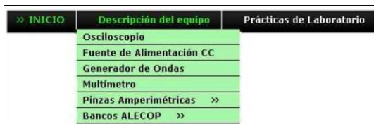
Figure 3. An example of a desplegable drop-down menu