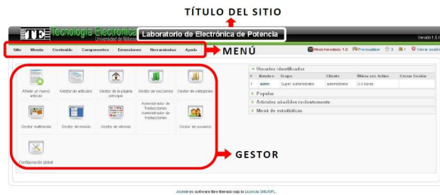
Figure 7. Administration homepage control panel