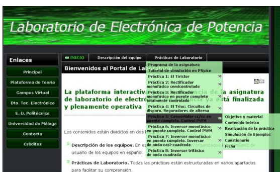
Figure 4. Drop-down menu of the laboratory practices