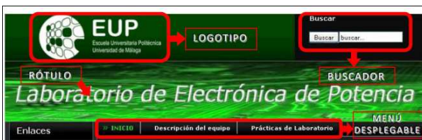
Figure 2. The platform head in detail