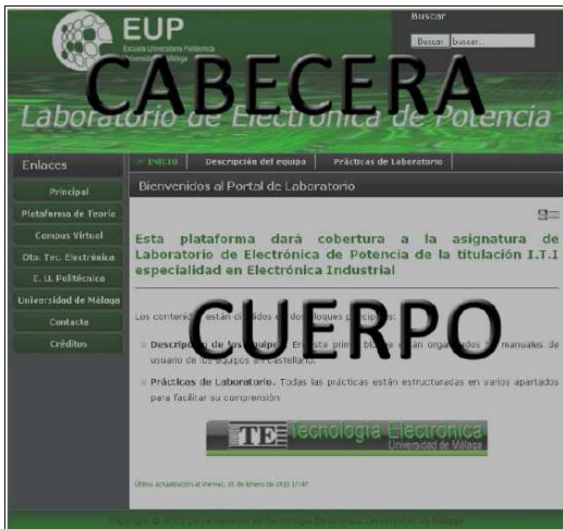
Figure 1. Head and body of the user area